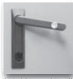
Swivel Recessed Handle