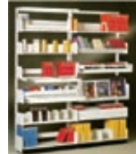
Quadral Lateral Storage System