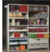
QuadraMobile Expandable Modular System